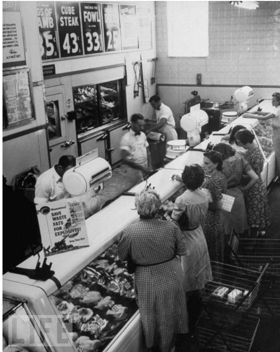
When I first started driving, who would have thought gas would someday cost 25 cents a gallon. Guess we'd be better off leaving the car in the garage.